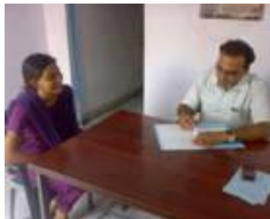
Intervention done by the psychiatrist

A total of 278 cases were counseled. Out of which 74 cases approached the center while 204 cases were intervened within the school by the counselor. The table below shows the total number of adolescent girls and boys who were given with counseling services. When categorized 270 cases (97%) fall under counseling category, 8 cases (3%) under psychiatric category. None of cases fall under advice category. Out of the 270 counseling cases, around 209 (77%) cases face academic problems, 61 (23%) cases face emotional / behavioral / personal/ family problems.